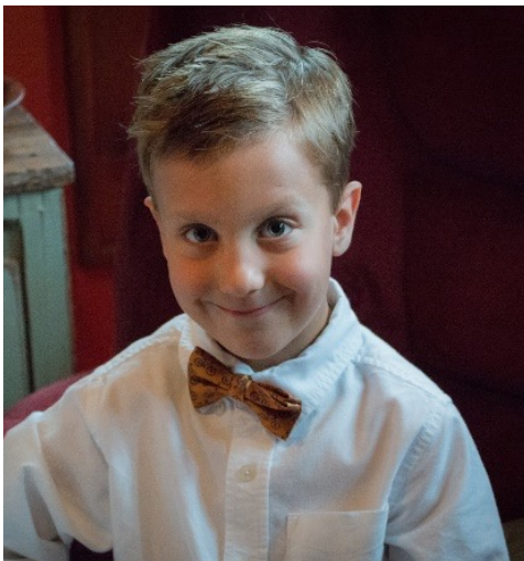
Then & Now