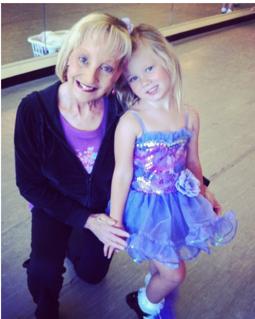
Then & Now