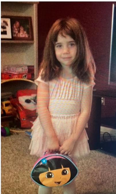
Then & Now