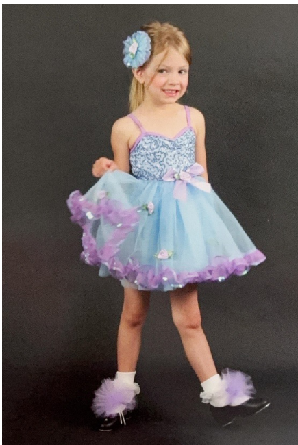
Then & Now