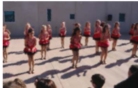
MM TiniTainers performing at the KC Zoo

performances planned for the first act of Clara's Dream, Union Station, and local senior living facilities!