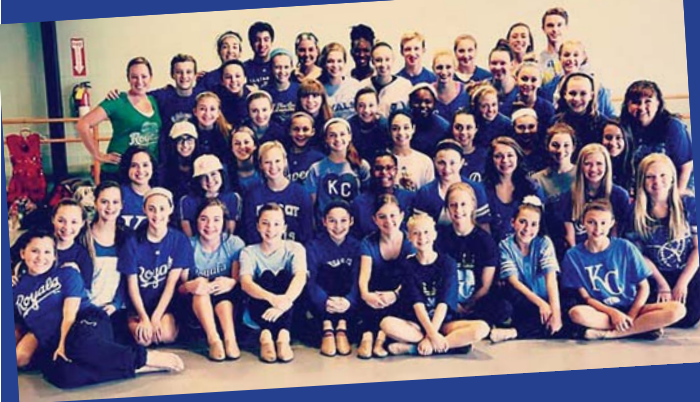
MM Entertainers cheer on the KC Royals!