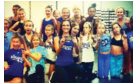
MM Jr. Competition Team Cheer on the K.C. Royals